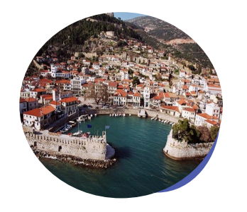
Western Greece Region

The Western Greece region supports its place-based strategies in innovation ecosystems. the region has set up horizontal priorities: