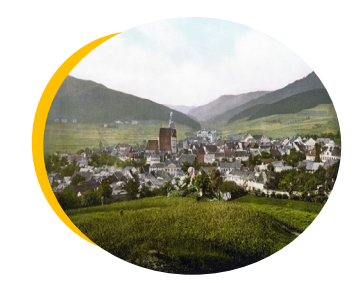
South Bohemia Region

Case studies: place-based strategies in innovation ecosystems